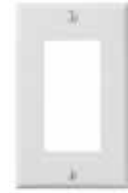
Inserts fit Decora® wallplates found on page K-9.