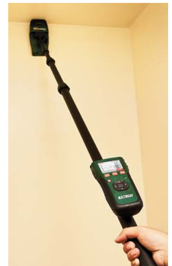
Wireless sensor affixes to telescoping handle