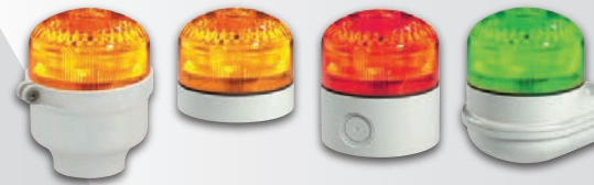
LED Combination Audible/Visual Signal Model SLM500

The Federal Signal StreamLine ® Modular Series is a new and unique concept developed to deliver a customized product tailored to each specific application.