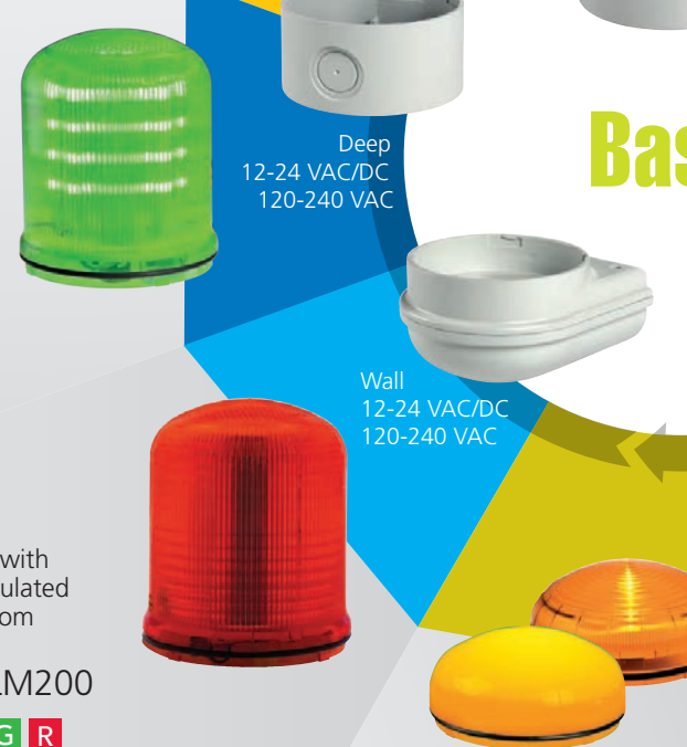
LED Beacon with Flashing/Simulated Strobe/Random Options Model SLM200