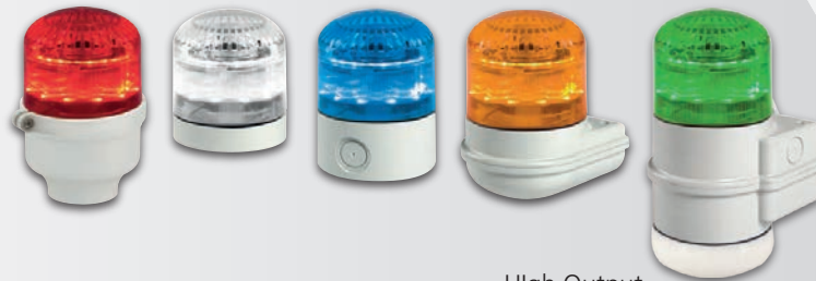
High Output LED Combination Audible/Visual Signal Model SLM600