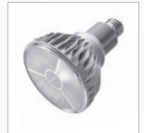
LBR SERIES LAMPS p.66 LED BR30 Lamp