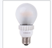
A19 SERIES LAMPS p.74 LED Omni-Directional Lamp