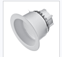
LR SERIES DOWNLIGHTS p.30 Commercial-Upgrade Downlight Solutions