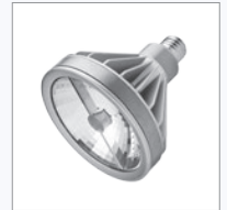
LRP SERIES LAMPS p.68 LED PAR Lamp