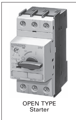
OPEN TYPE Starter