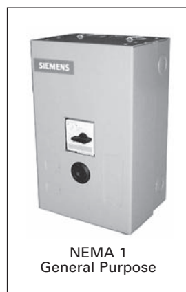
NEMA 1 General Purpose