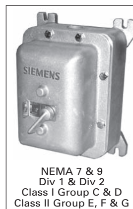
NEMA 7 & 9 Div 1 & Div 2 Class I Group C & D Class II Group E, F & G