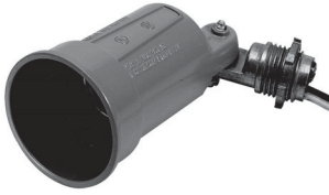
TP7162 - TP7165

DIE CAST ALUMINUM CONSTRUCTION, UP TO 150 WATTS, WITH LAMP GASKET, UL LISTED