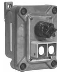
Combination Push Button and Pilot Light