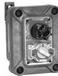
Combination Selector Switch and Pilot Light