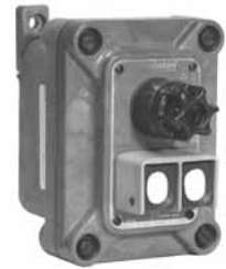
Combination Push Button and Pilot Light