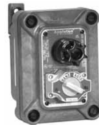
Combination Selector Switch and Pilot Light