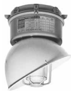
Ceiling Mount Fixture with Prismatic Glass Globe, Guard and Polyester 30° Angle Reflector