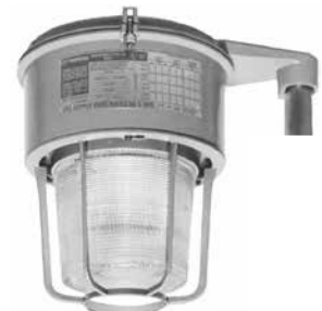
Straight Stanchion-Mount Fixture with Prismatic Glass Refractor and Guard