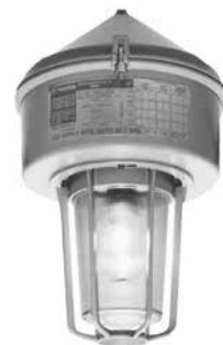
Pendant Cone Fixture with Prismatic Glass Globe and Guard