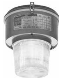
Pendant Mount Fixture with Prismatic Glass Refractor