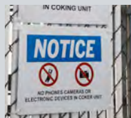
Custom Signs On Demand