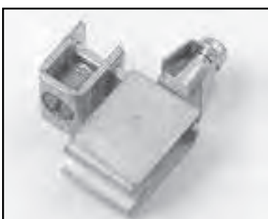
MS5-(5th Jaw) 1

1 Midwest Electric manufactured meter socket only. - mounts in 3 o'clock & 9 o'clock positions - used as grounding device