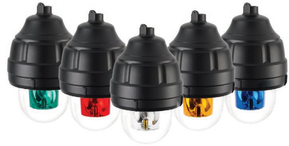
(Shown with pendant mount. See how to order for mounting options)