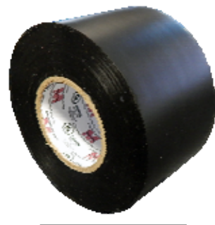
Comparable to 3M 50