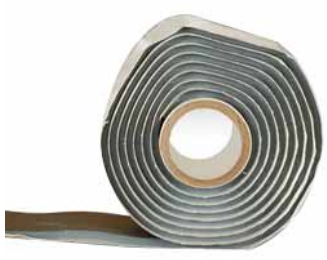
Comparable to 3M SCOTCHFIL