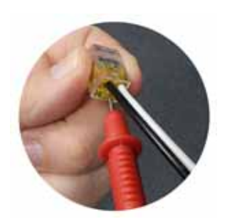
3. Use a voltage tester to test your connection via the port on the connector