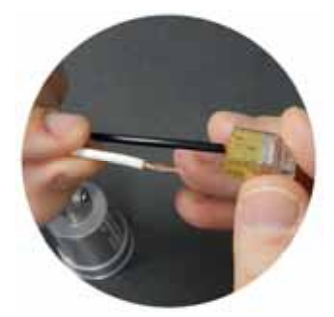
2. Push the stripped stranded or solid conductor into the port of connector completely. No more twisting or taping.