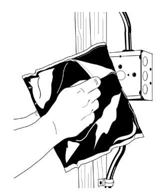
Remove poly liner from one side of pad.