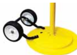
OPTIONAL WHEEL KIT