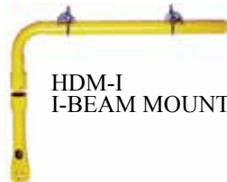
HDM-I I-BEAM MOUNT