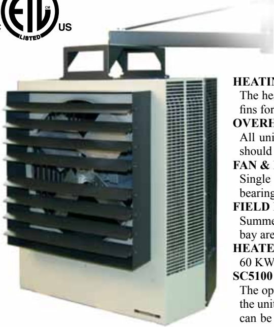
Manufactured in U.S.A.